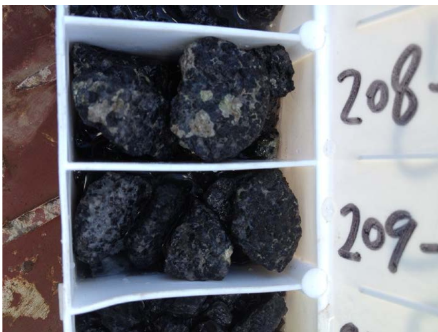
Plate 1. Drill chips, hole PLRC003, interval 208-210m

Cautionary note: These chips are not necessarily representative of the 1 metre interval from which they came, nor are they representative of all intervals containing disseminated pyrrhotite and chalcopyrite.