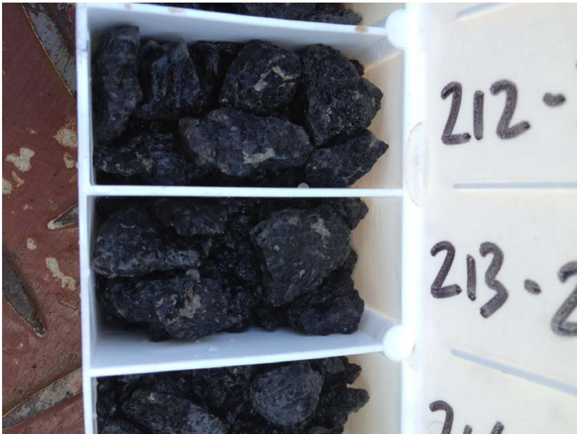
Plate 3. Drill chips, hole PLRC003, Interval 227-230m